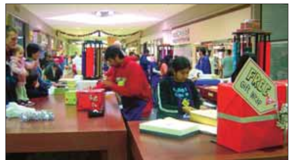
Northwest Y Service Club in action for ASF

Ninety percent of all money collected for the Alexander Scholarship Fund is retained at the local level (country or Region) and the remaining 10% is passed on to IHQ for allocation at international level. Reporting has not always been accurate and it has been difficult to establish how much is collected each year. Plans for ASF augmentation have been introduced by Y's Men International and I have set out my plan of action in line with this procedure. A standard reporting form and procedure was prescribed to allow final analysis at the International level. I briefed the RDs, ASDs and RSDs about this vision through a circular with copies to the International executive officers and IHQ.